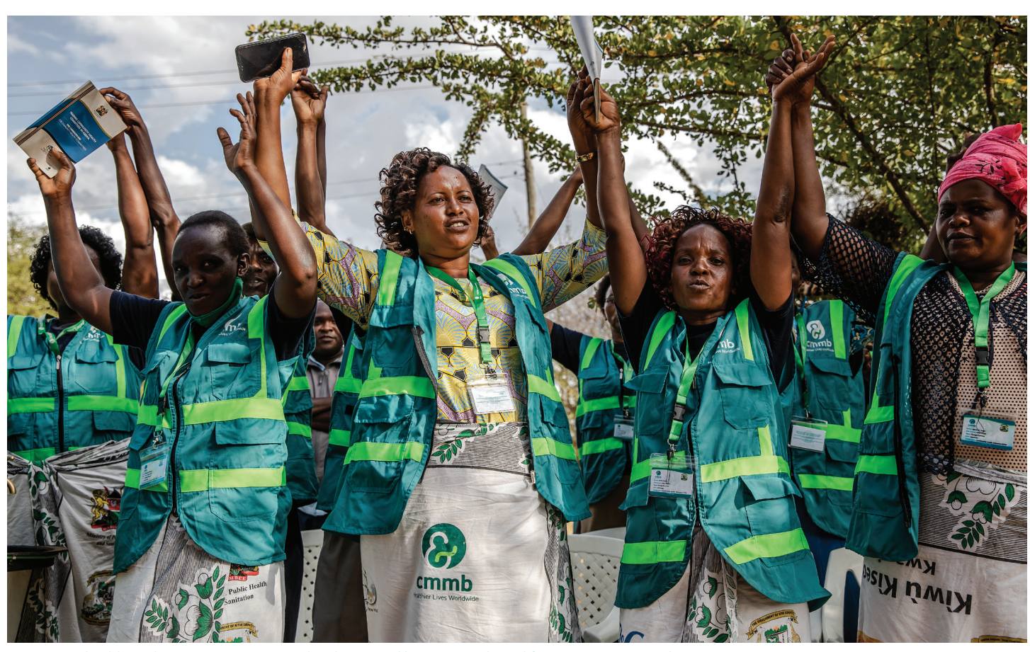
Community health workers in Kenya are trained and equipped by CMMB to bring life-saving services to their communities.

I am grateful for when the community agrees to my advice. I always congratulate them and tell them to keep it up. It gives me a lot of motivation when I return to a home to find that someone has listened to me. It is my hope that they will continue practicing what I am teaching them, and they will live a life that is not troublesome."